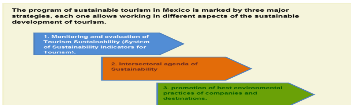
Figure 2. Three broad categories of sustainable tourism in Mexico.